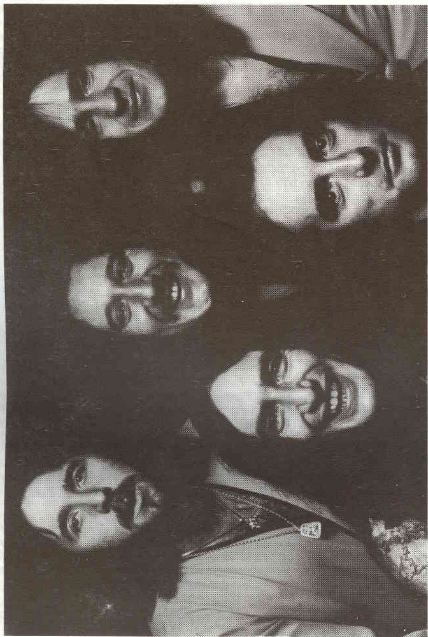
The Firefly line up, from left to right:- Lee Kerslake, Ken Hensley, Mick Box, John Lawton and Trevor Bolder.